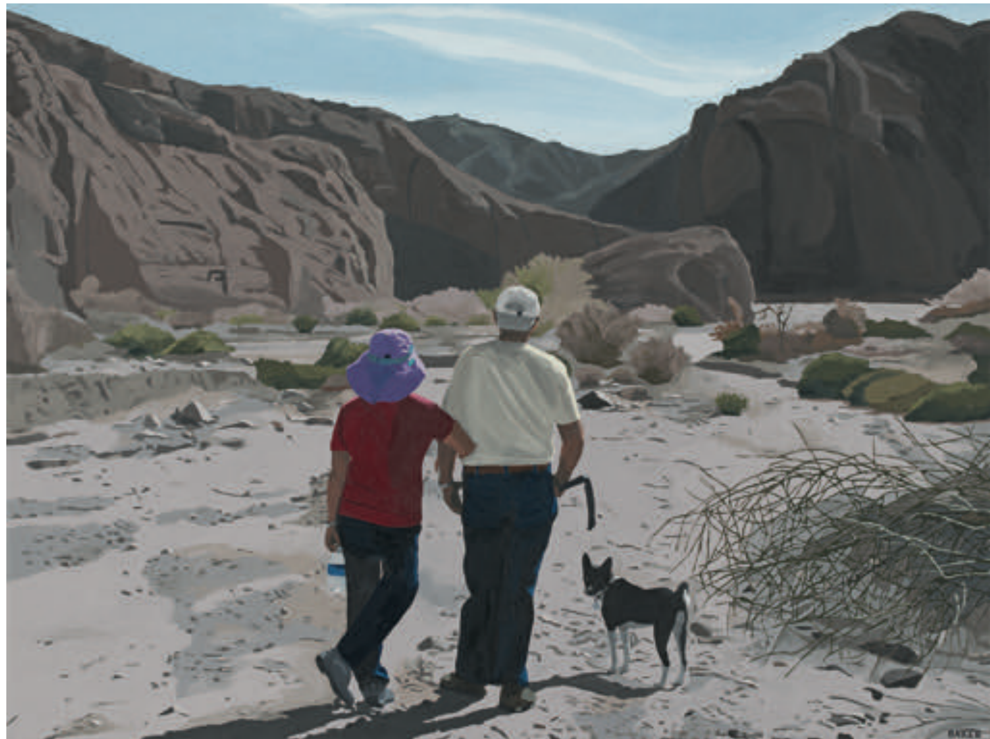
Wanderers / oil on canvas / 30 x 40 inches