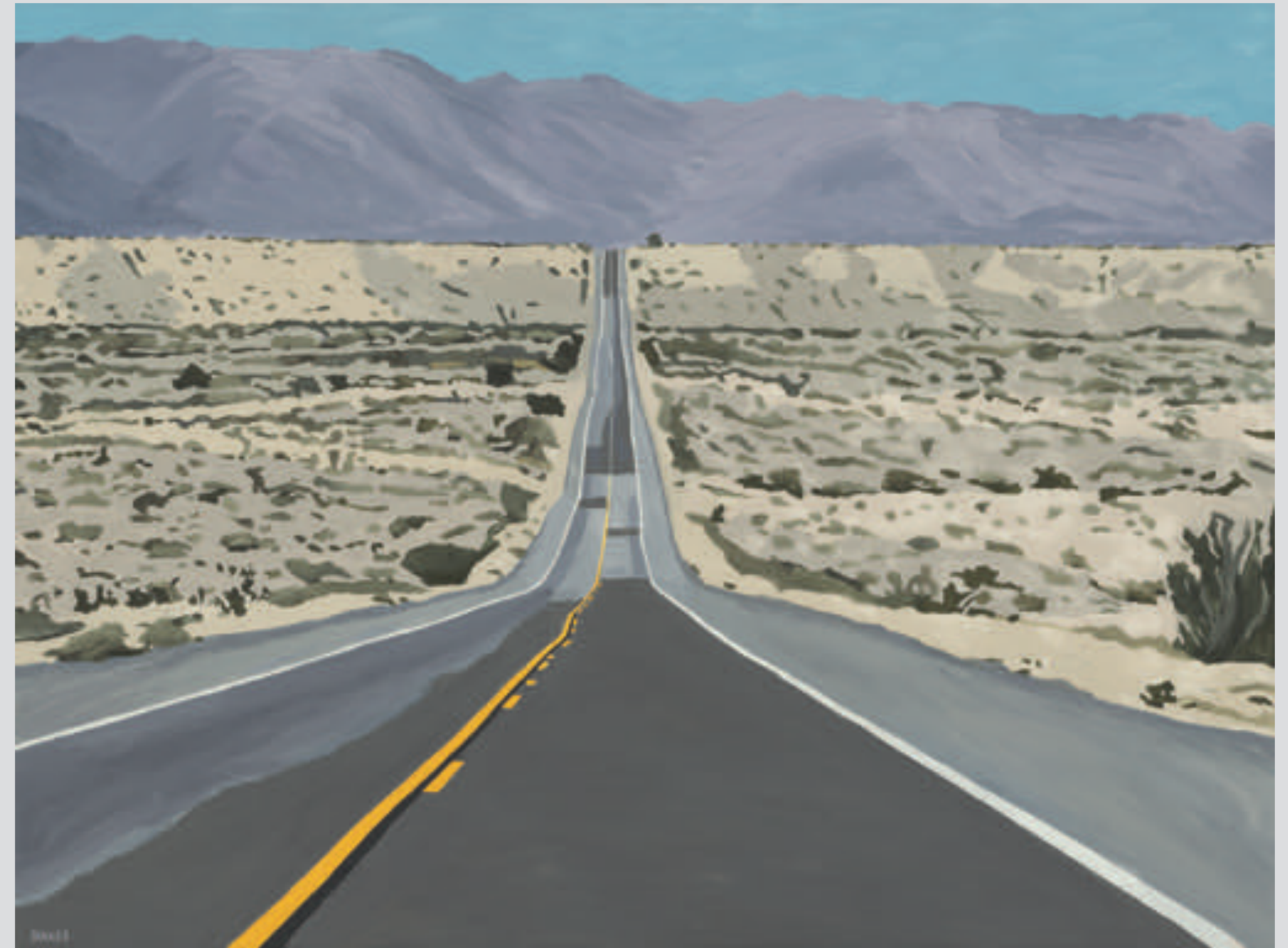
Road To Borrego | oil on canvas | 36 x 48 inches