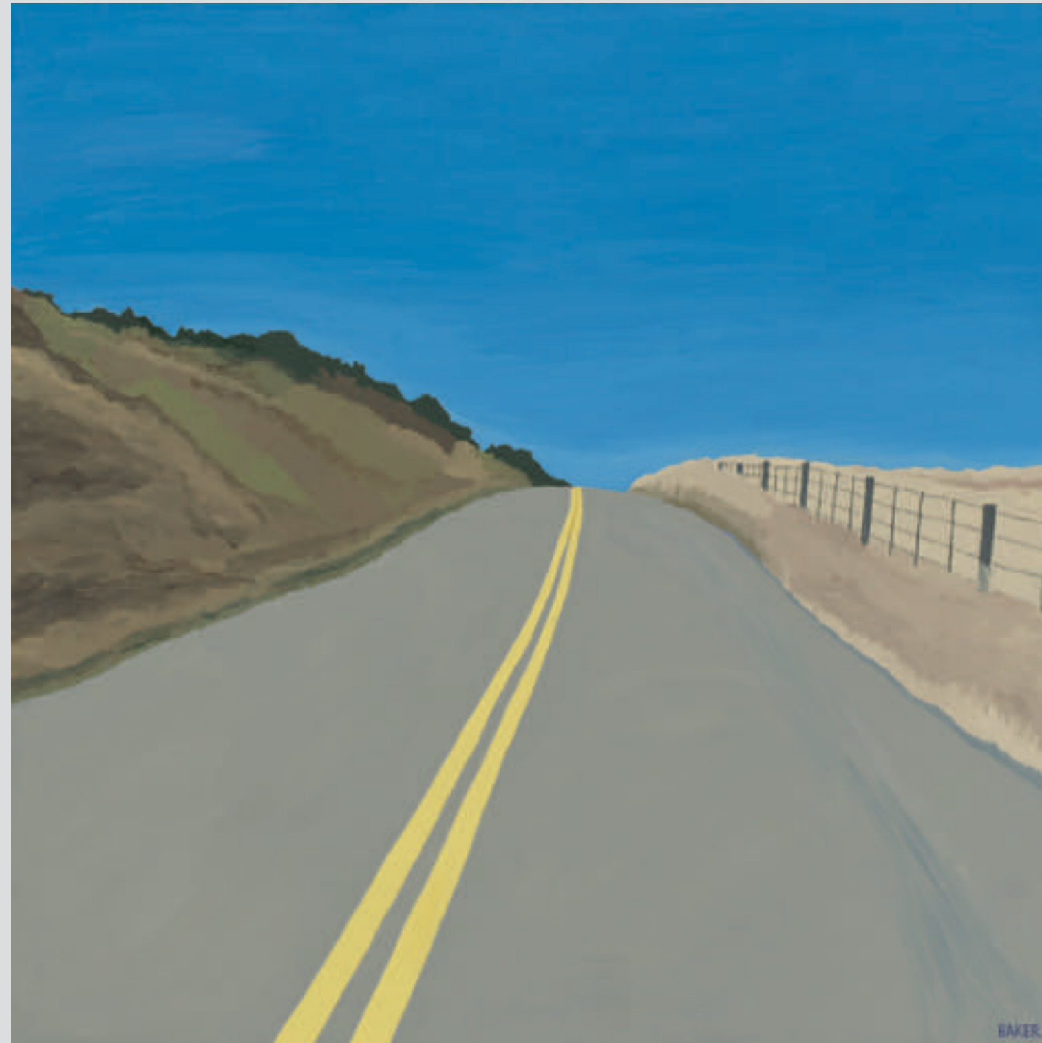
Over Yonder | oil on canvas | 36 x 36 inches