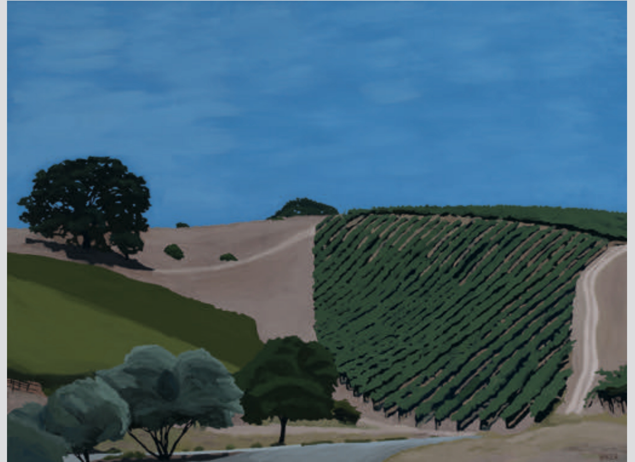
Hillside Vineyard | oil on canvas | 36 x 48 inches