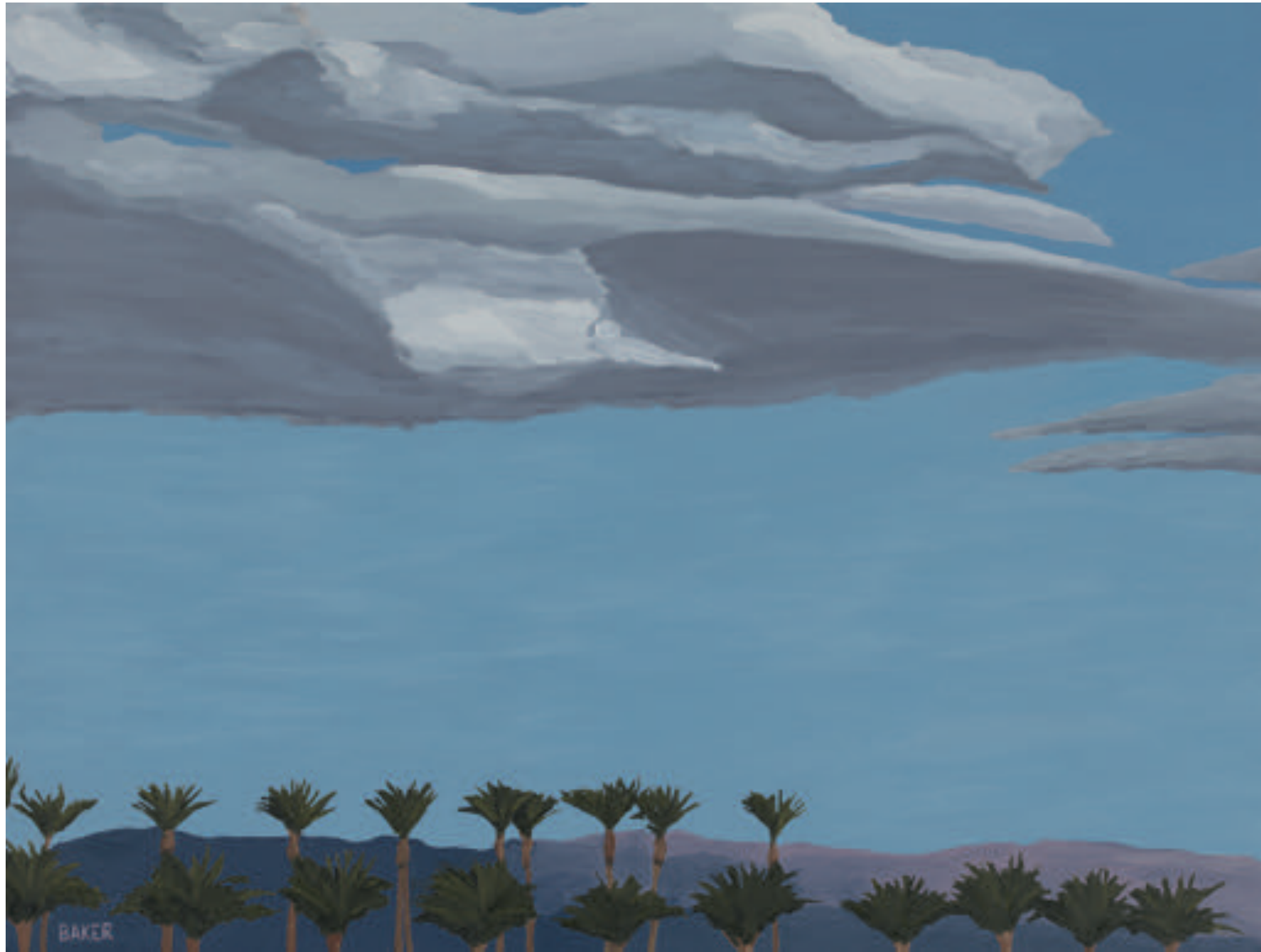
Above The Palms | oil on canvas | 30 x 40 inches