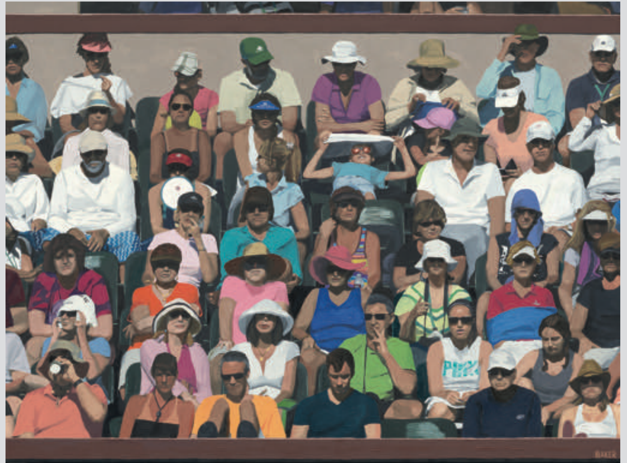
After The Storm | oil on canvas | 36 x 48 inches