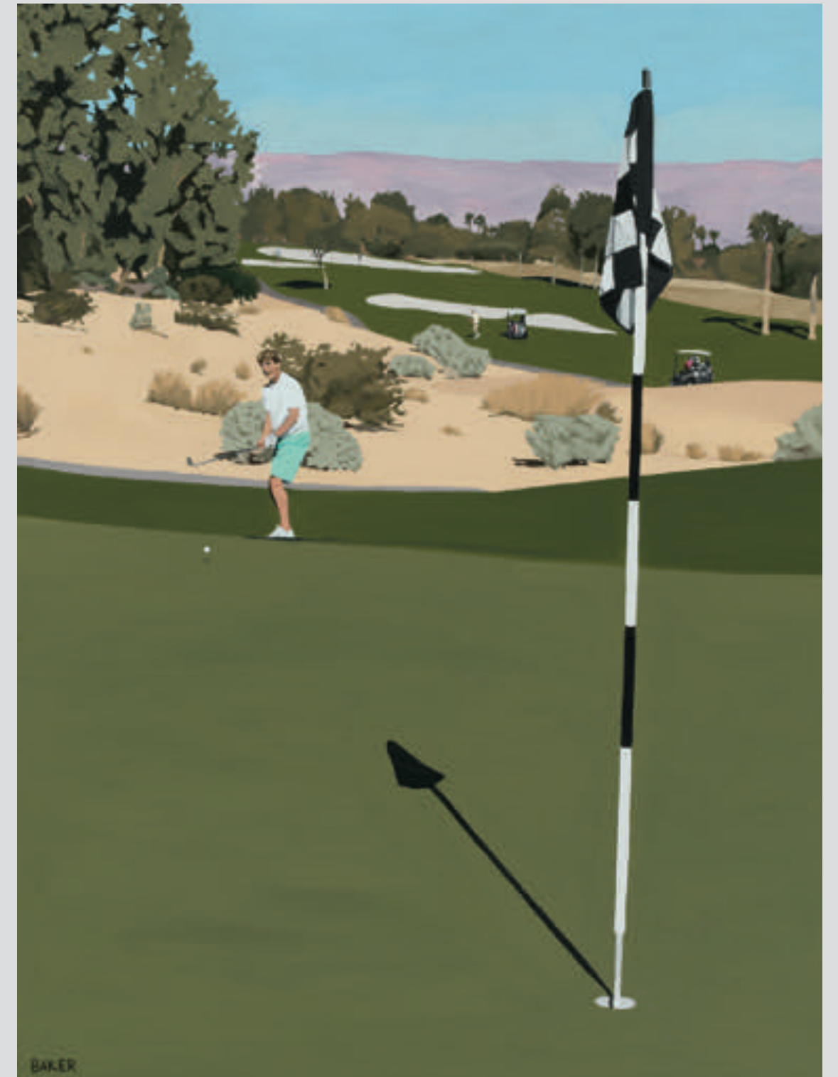
Chip & A Putt | oil on canvas | 40 x 30 inches