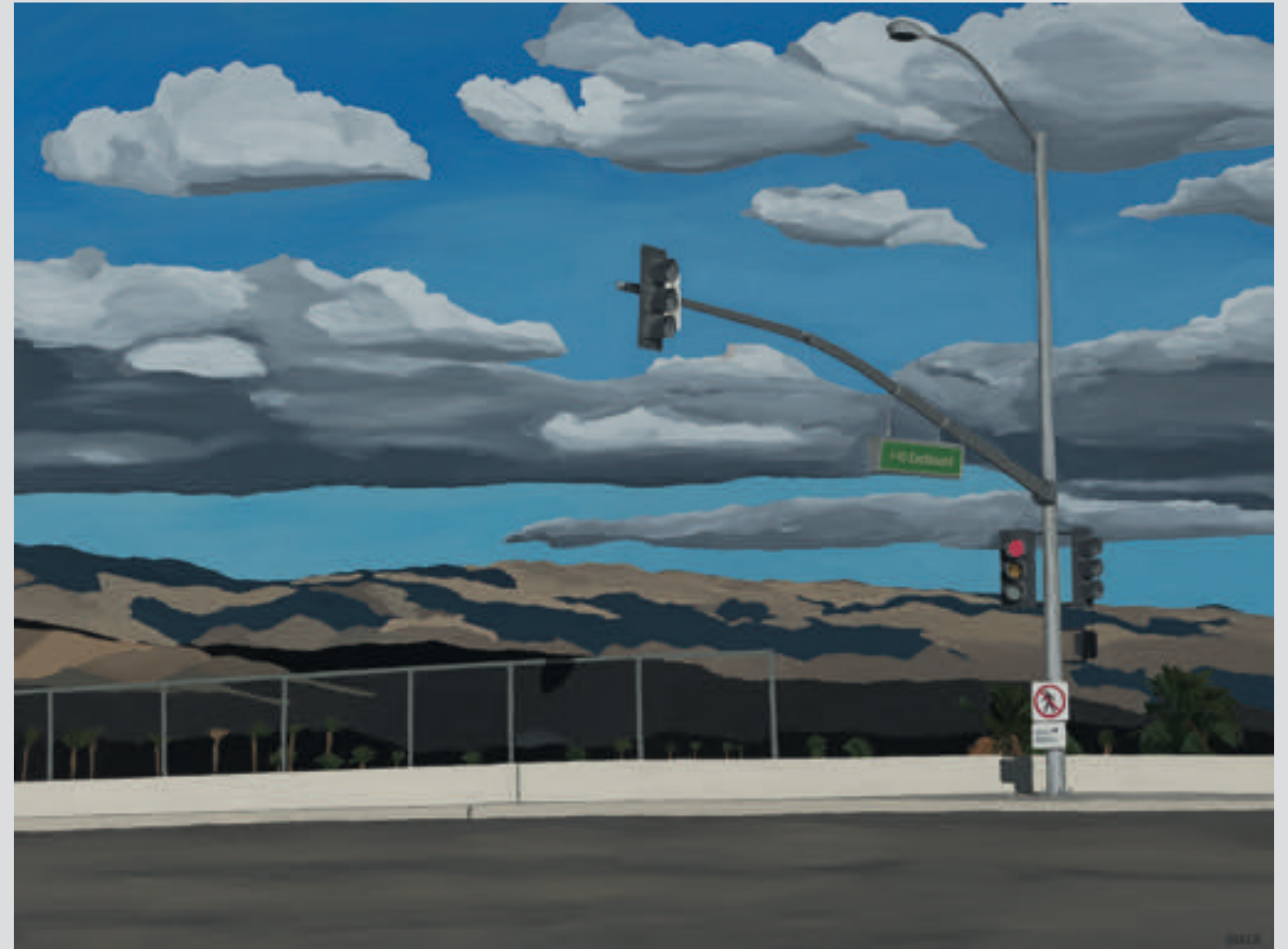
Eastbound | oil on canvas | 45 x 60 inches