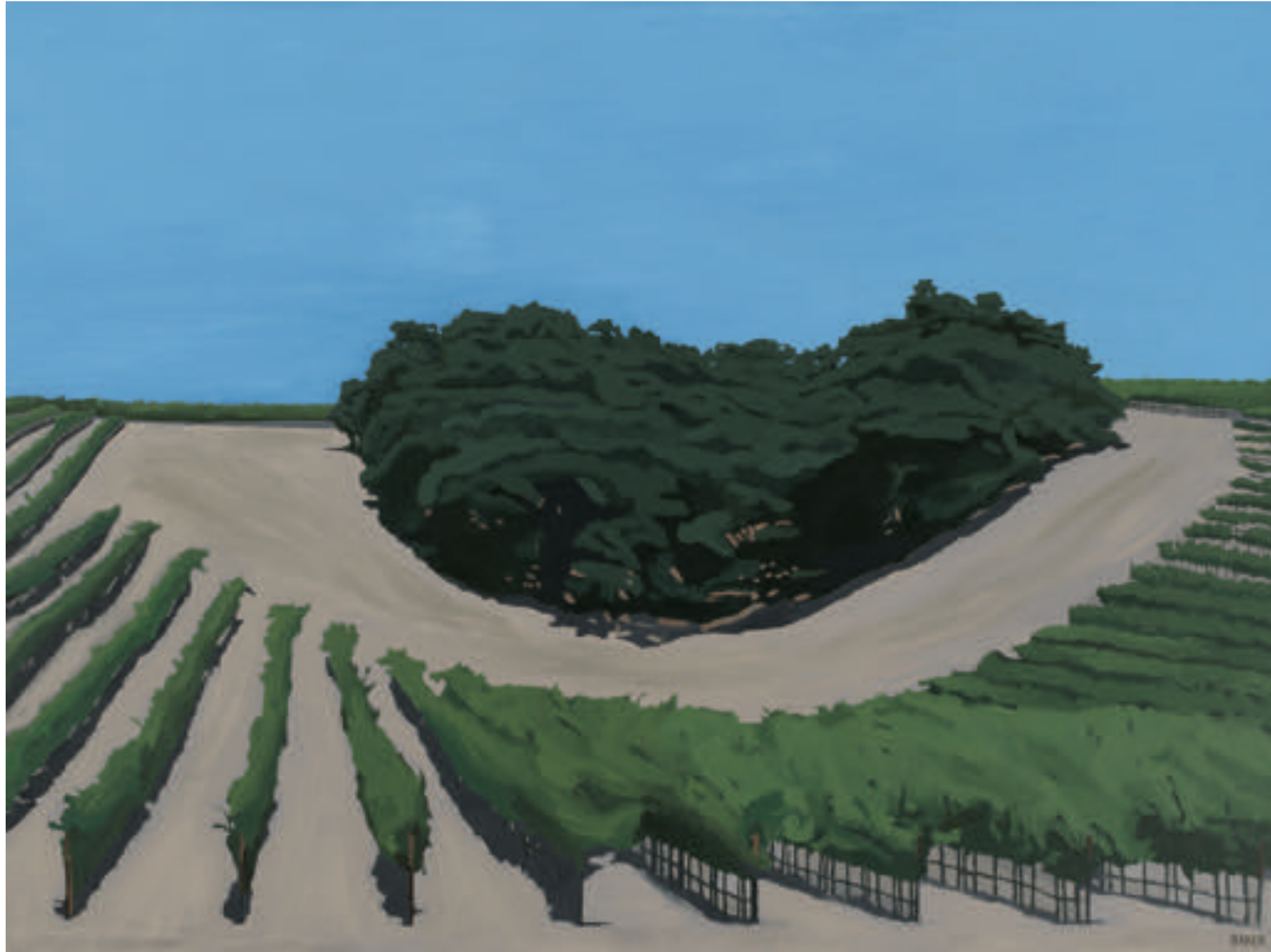
Vineyard with Old Oaks | oil on canvas | 36 x 48 inches