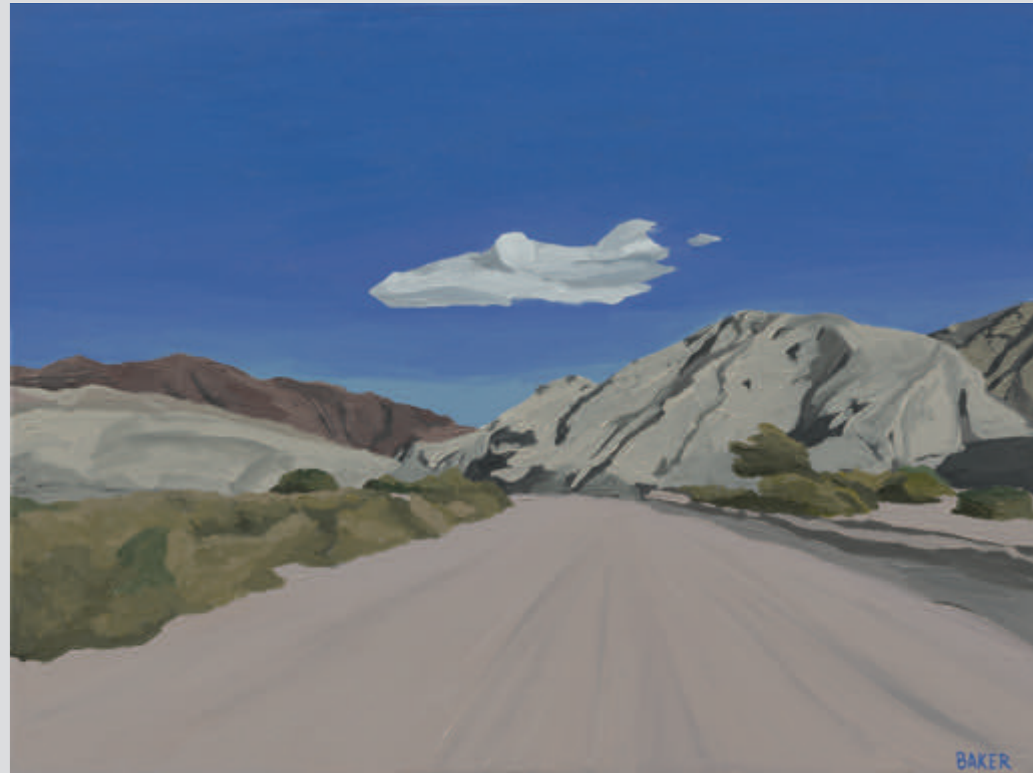
Painted Box Canyon / oil on canvas / 18 x 24 inches