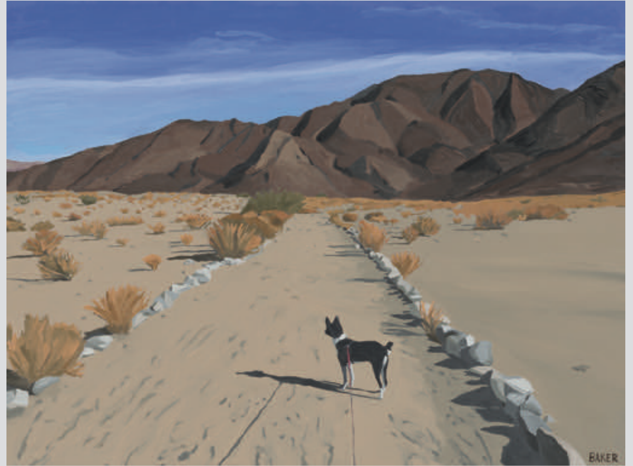
La Quinta Cove | oil on canvas | 24 x 32 inches