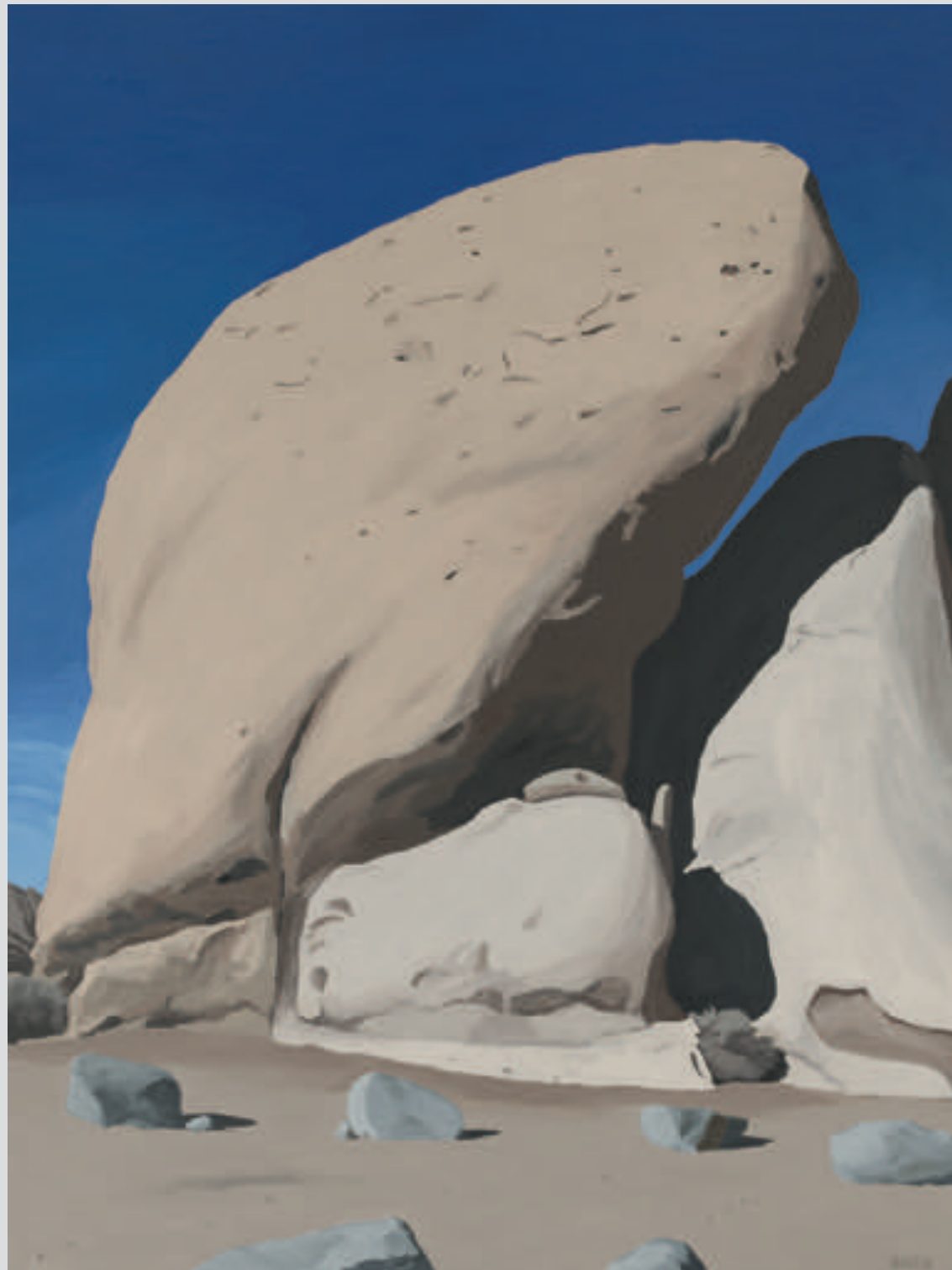
Joshua Tree Monolith | oil on canvas | 48 x 36 inches