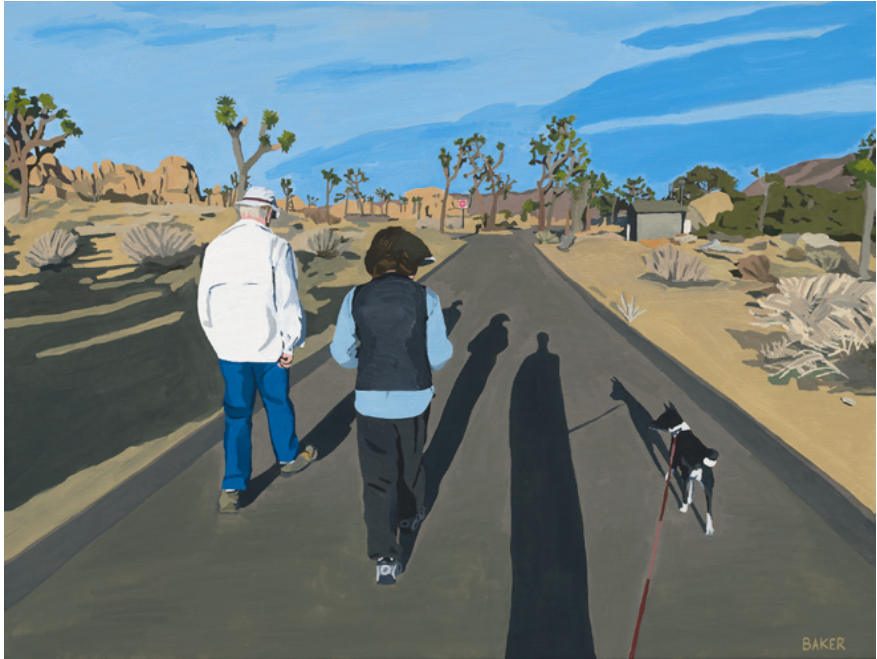
JOSHUA TREE HIKERS