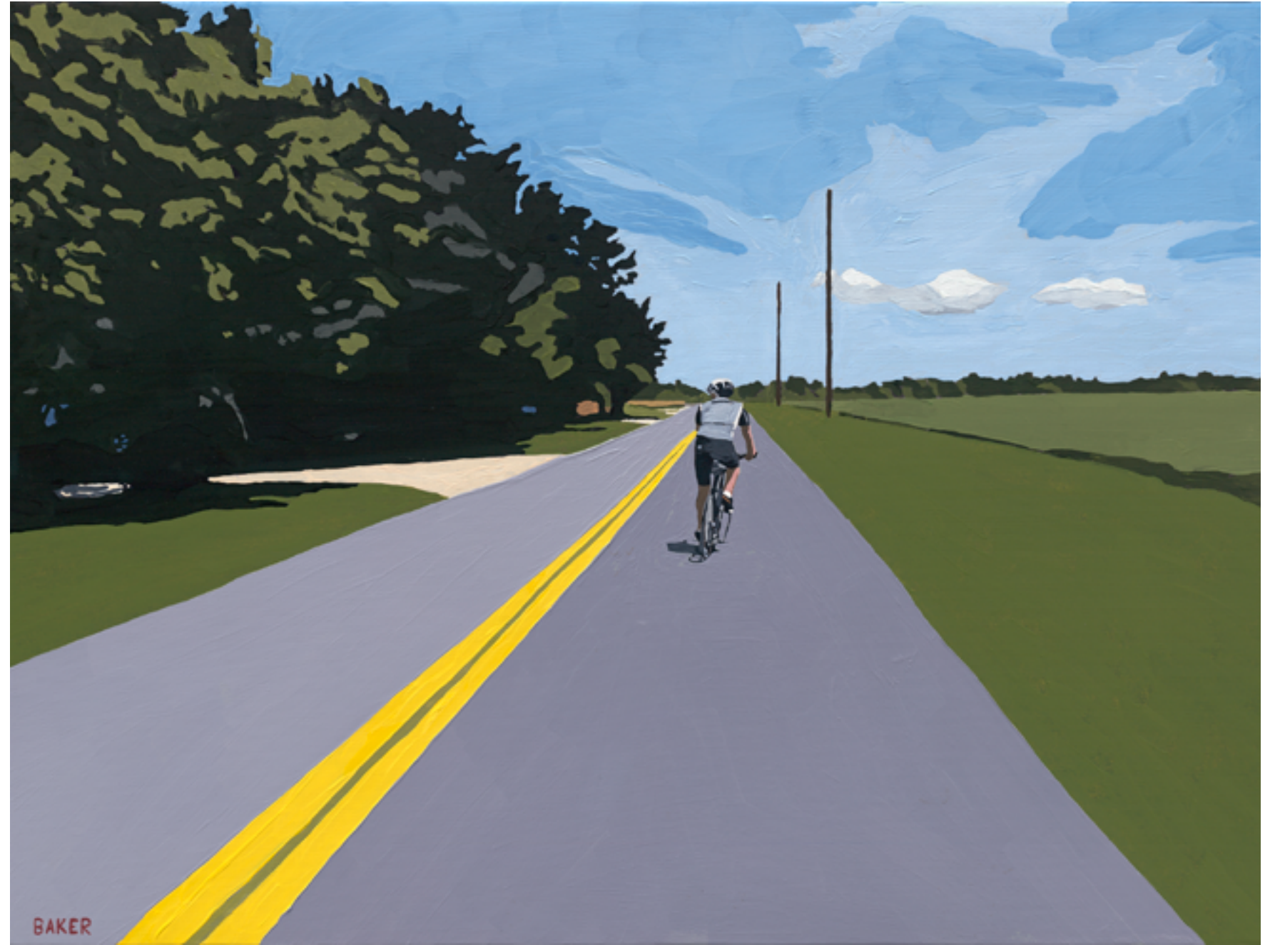
HAMPTONS BIKE RIDE