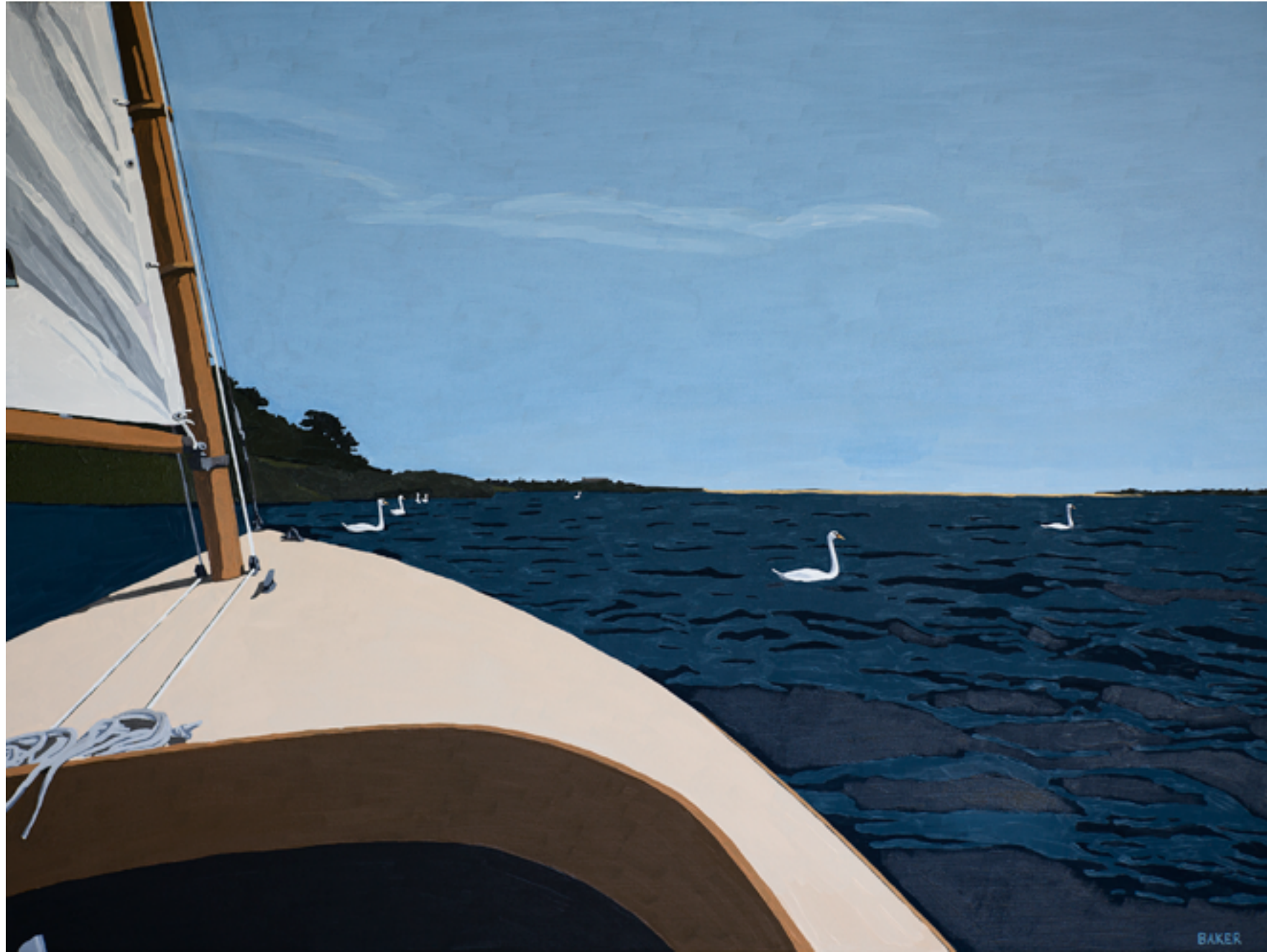
ON GEORGICA POND